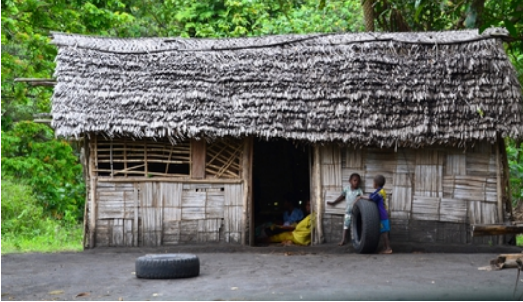
A typical house on the island of Tanna – a grass hut with a dirt floor and no screens, running water, toilet, electricity or kitchen.

I decided to help my new John Brum friends by approaching the White House directly. I tried to send an email, but Barak Obama doesn't have an email, only a window on the White House website, where you write in your request. I wrote, "I have what is perhaps one of the most unusual requests you have ever had. I am writing on behalf of a very poor tribe on Tanna island that loves Americans and wants $13 million in US aid. Even if you can't provide that, perhaps you can give a little something...." I supplied the White House with the email address and name of a school teacher in the provincial capital who is the tribe's only link to the outside world.